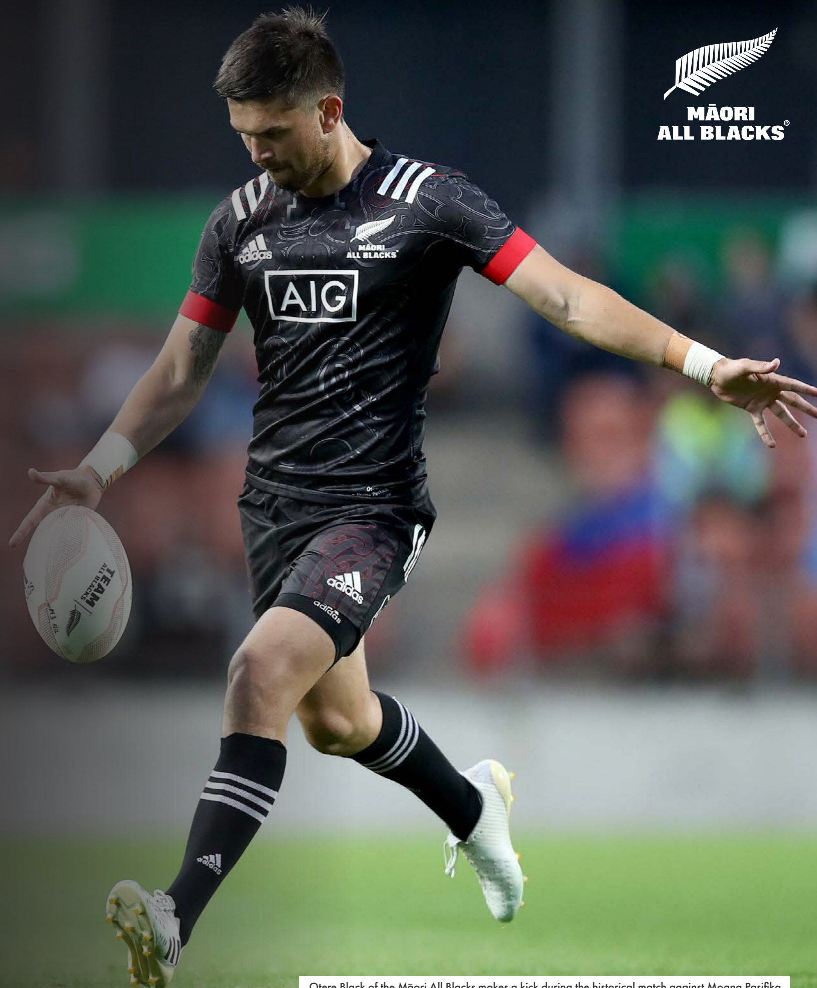
Otere Black of the Māori All Blacks makes a kick during the historical match against Moana Pasifika.