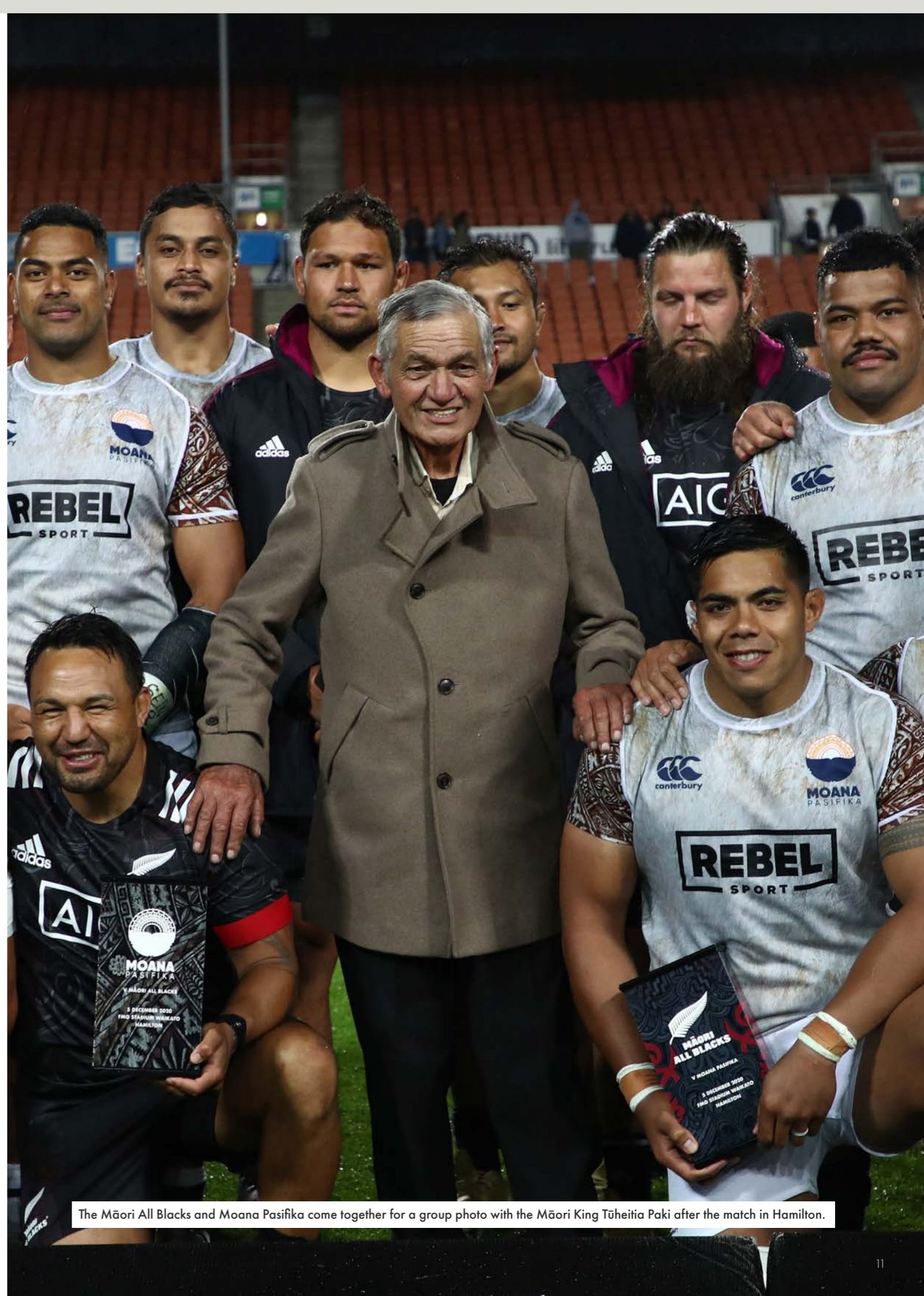
The Māori All Blacks and Moana Pasifika come together for a group photo with the Māori King Tūheitia Pahi after the match in Hamilton.