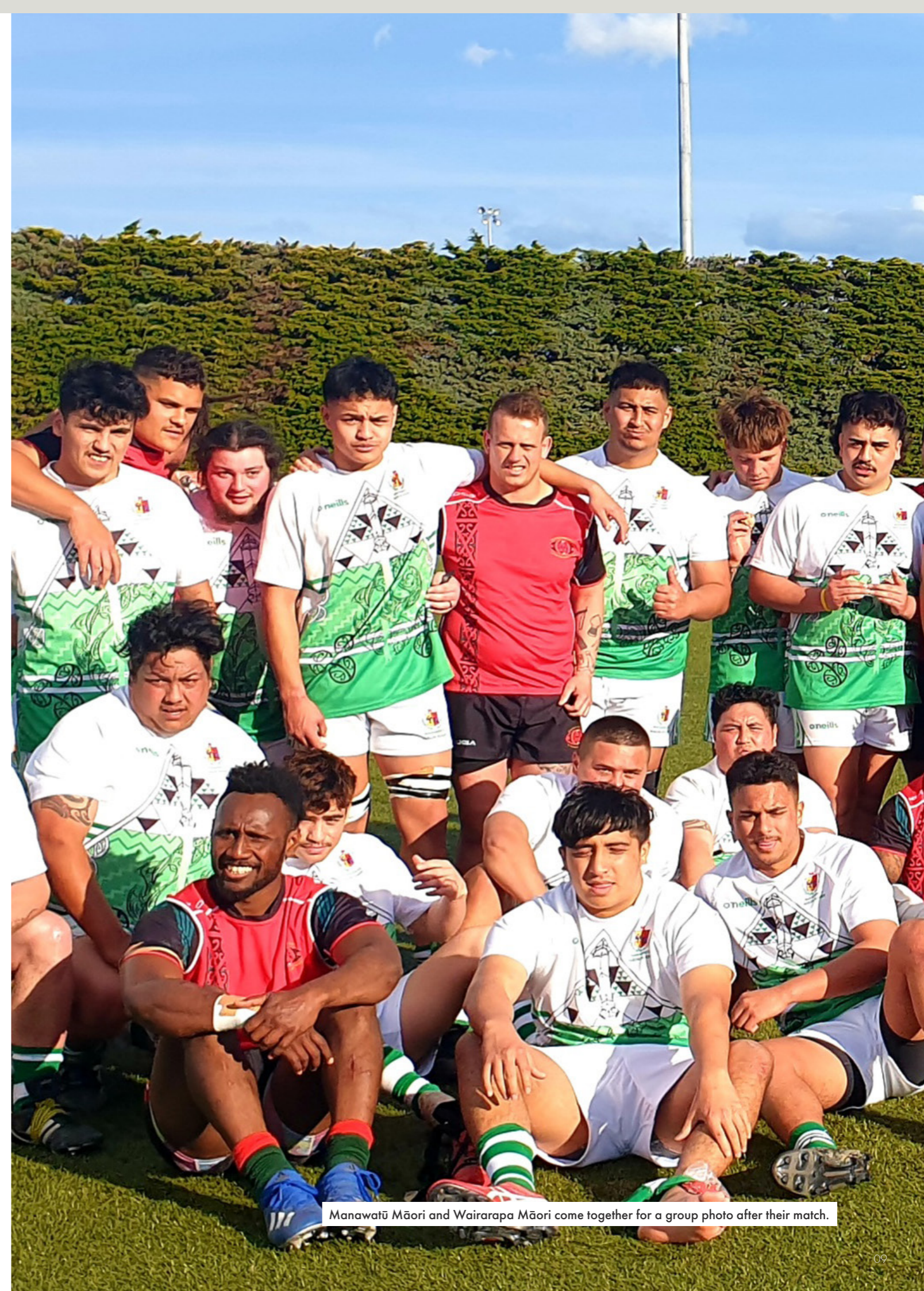
Manawatū Māori and Wairarapa Māori come together for a group photo after their match.

2020 was a challenging year for a lot of our national teams in Aotearoa so it was a huge honour to represent